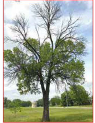
EAB tree at Washington St. Park

The City of Prairie du Chien Park & Recreation Department is advising residents that both the Department of Agriculture and Wisconsin DNR have confirmed the Emerald Ash Borer (EAB) in our community. The insect, which has infested trees throughout the nation, is not a threat to human or animal health but poses a risk to the community's ash trees. Infested ash trees can pose a risk to public safety due to the fact that their branches become very brittle and can fall on people and property.